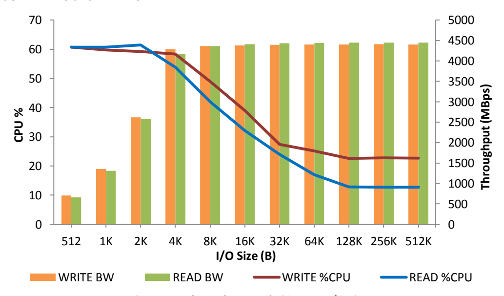
Figure 1 - Throughput and %CPU vs. I/O size

The following graph plots the unidirectional iSER READ and WRITE throughput and CPU usage numbers using the fio tool. The I/O size used varies from 512B to 512KB with an access pattern of random READs and WRITEs.